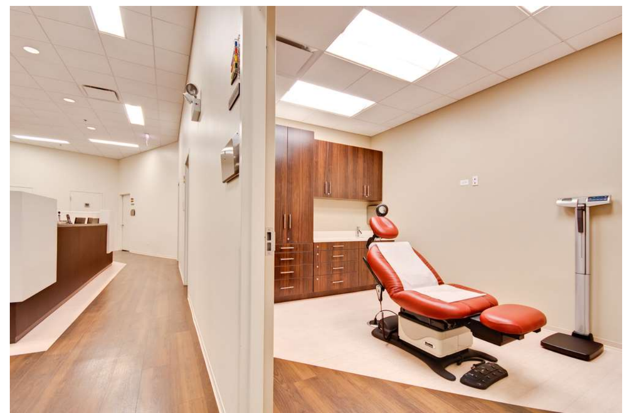
Page | 5