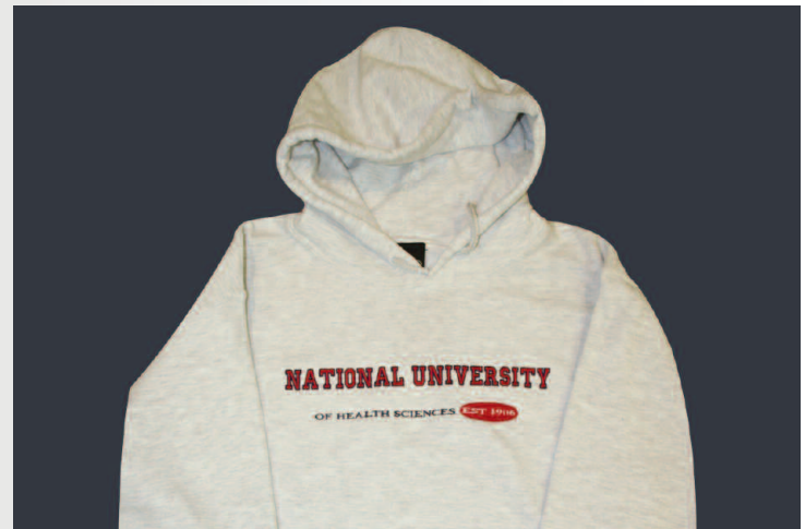
Ash Gray Hoodies, $26.00