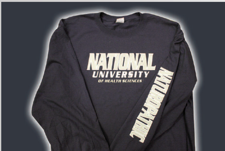
Long Sleeve T-shirt with Naturopathic on Lft. Sleeve, $21.95