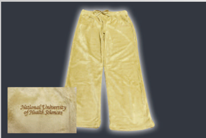
Butterscotch Bunny Fleece Pants, $22.50