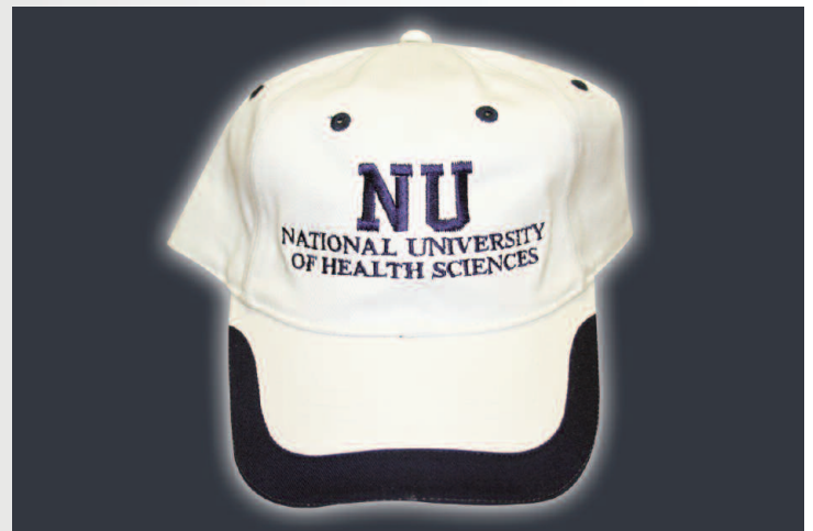
White With Navy Baseball Cap, $11.75