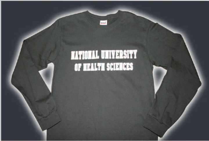
Long Sleeve T-shirt, $16.50

Available through the NUHS campus bookstore