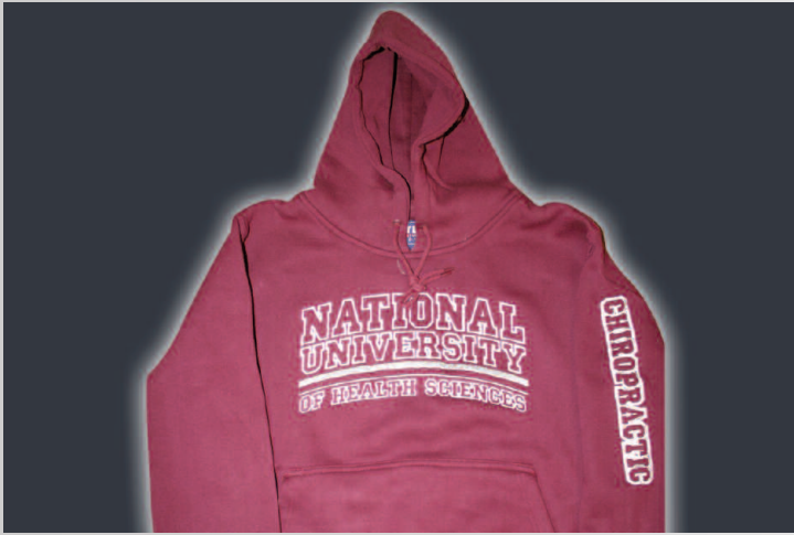
Maroon Hoodies with Chiropractic on Lft. Sleeve, $35.95

Available through the NUHS campus bookstore