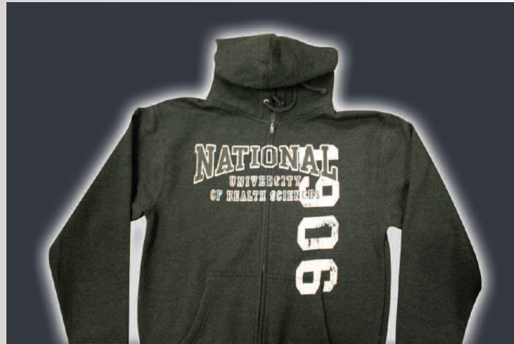
Zip-up Charcoal Gray Hoodies, $28.00, 2XL $30.00

Available through the NUHS campus bookstore