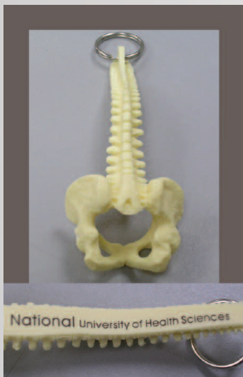
Imprinted Spine Key Ring $2.25