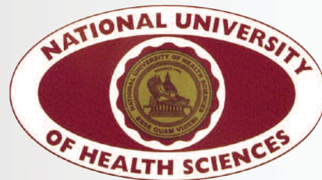
Small NUHS Window Decal $1.29