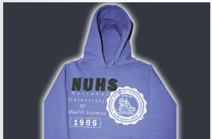
Royal Blue Appliqued Hoodies, $36.95, 2XL $38.95