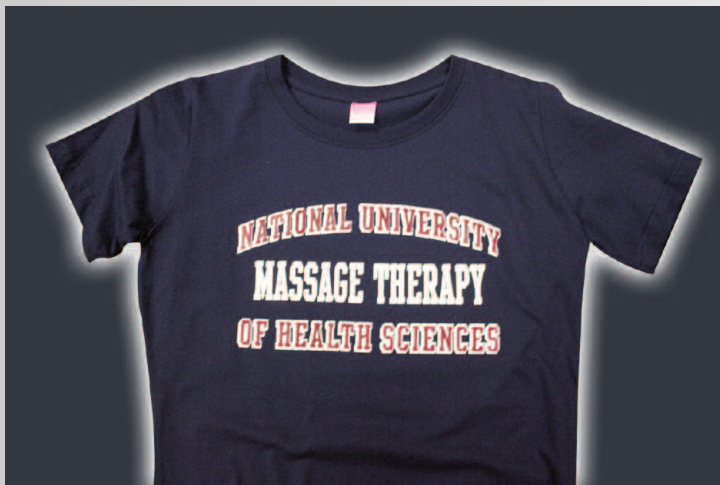
Massage Therapy T-shirt, $14.00