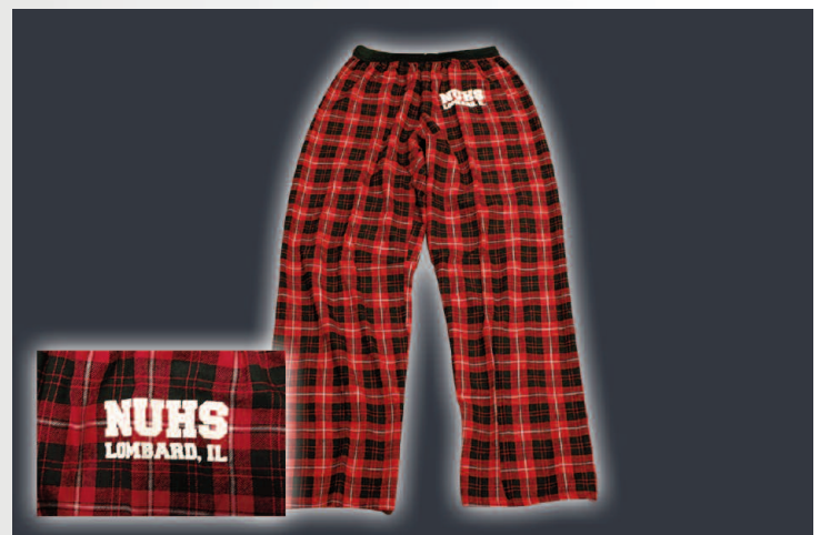
Red Flannel Pants, $23.95