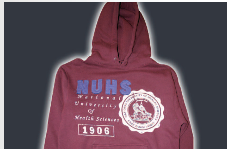
Maroon Appliqued Hoodies, $36.95, 2XL $38.95