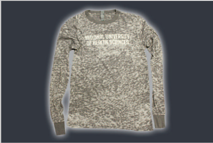
Asphalt Long Sleeve T-shirts, $21.00

Available through the NUHS campus bookstore