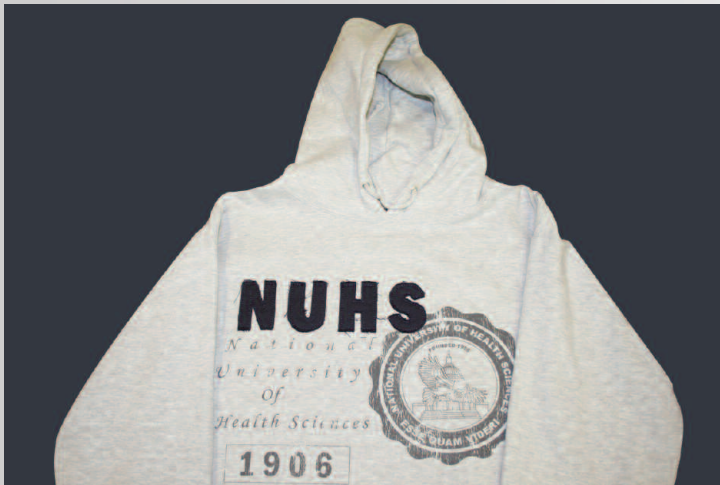
Ash Gray Applied Hoodies, $36.95

Available through the NUHS campus bookstore