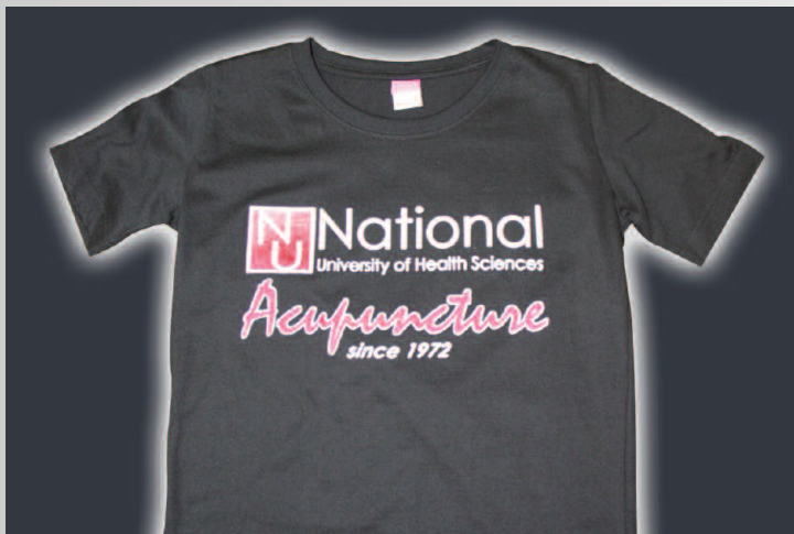
Acupuncture T-shirt, $14.00