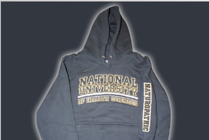
Navy Hoodies with Naturopathic on Lft. Sleeve, $35.95