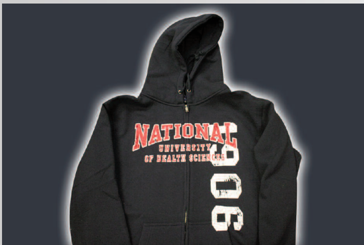
Zip-up Navy Blue Hoodies, $28.00, 2XL $30.00