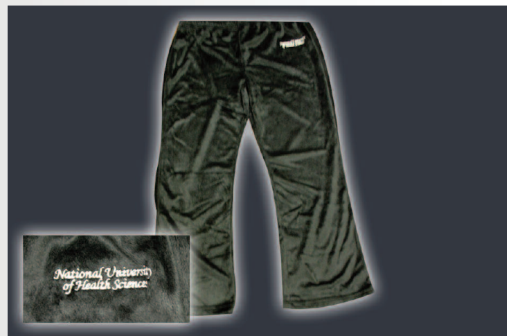
Black Bunny Fleece Pants, $22.50