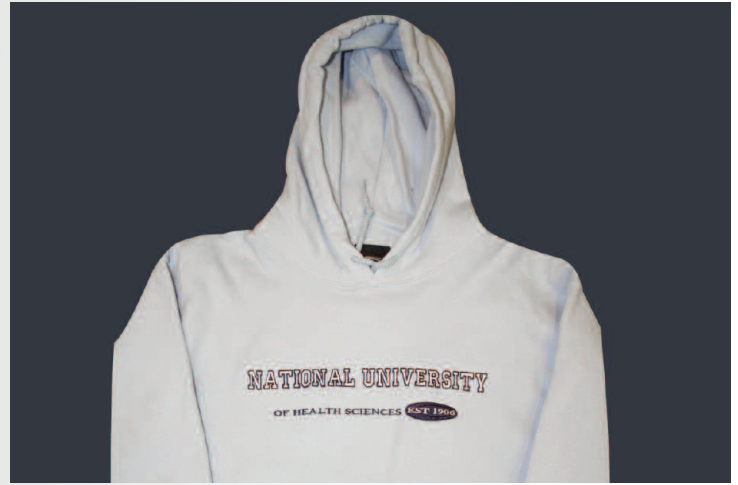
Carolina Blue Hoodies, $26.00