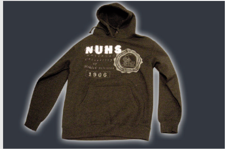
Charcoal Gray Applied Hoodies, $36.95, 2XL $38.95