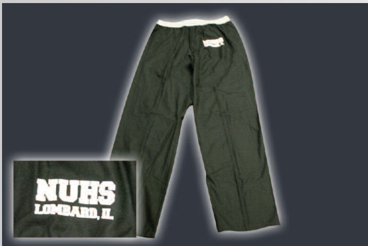
Black Flannel Pants, $23.95