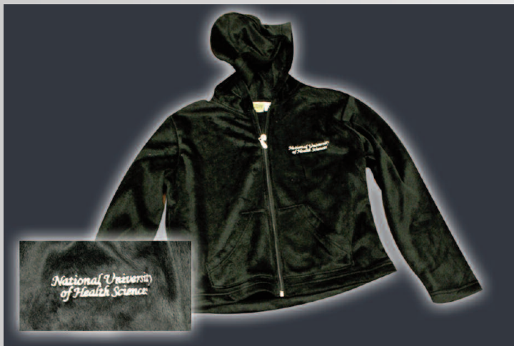
Black Bunny Fleece Hoodies, $28.50