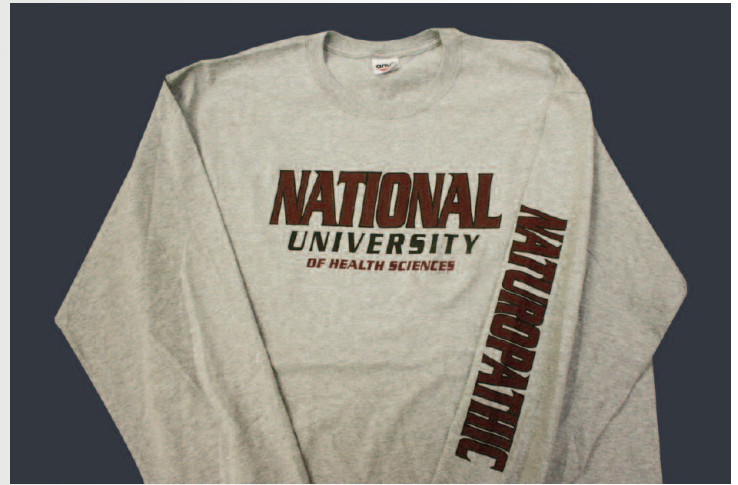
Long Sleeve T-shirt with Naturopathic on Lft. Sleeve, $21.95