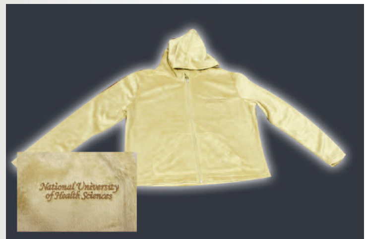
Butterscotch Bunny Fleece Hoodies, $28.50