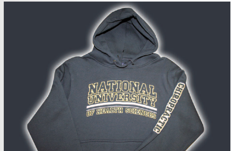
Navy Hoodies with Chiropractic on Lft. Sleeve, $35.95