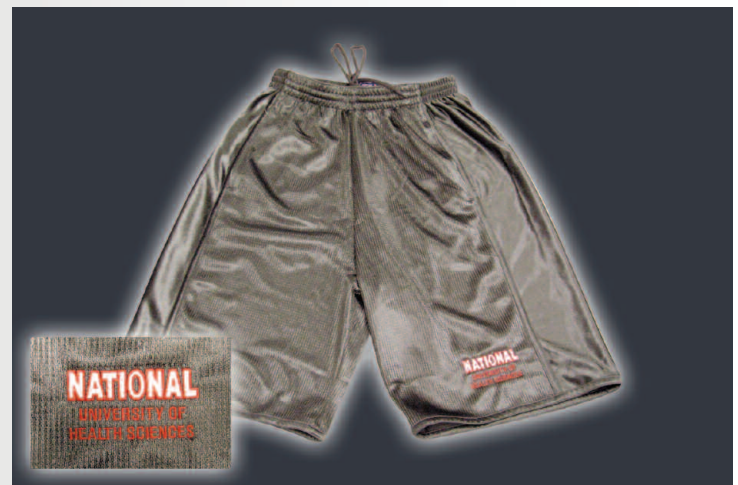
Gray Basketball Shorts, $24.95