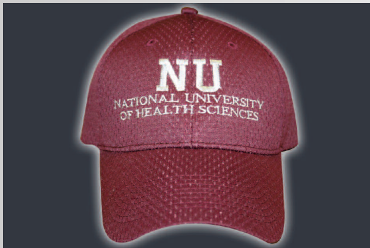
Maroon Baseball Cap, $11.75