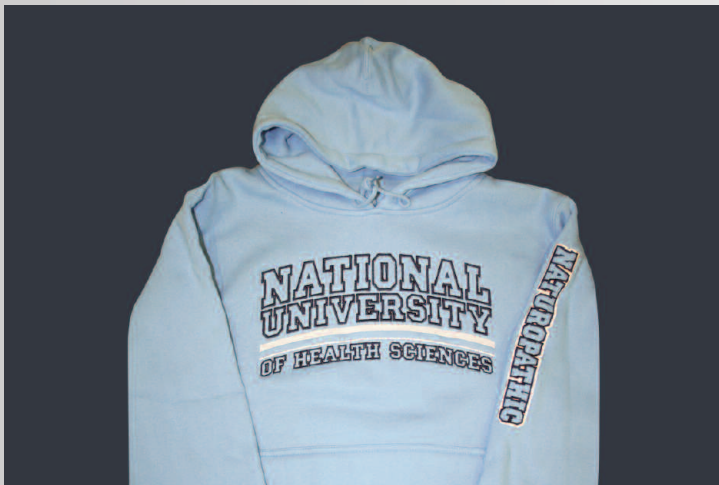
Carolina Blue Hoodies with Naturopathic on Lft. Sleeve, $35.95