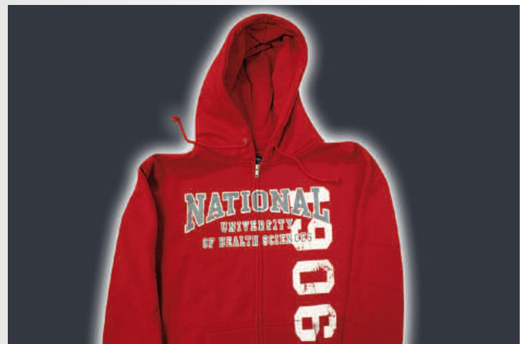
Zip-up Red Hoodies, $28.00, 2XL $30.00