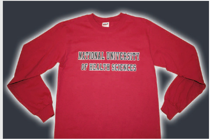
Long Sleeve T-shirt, $16.50